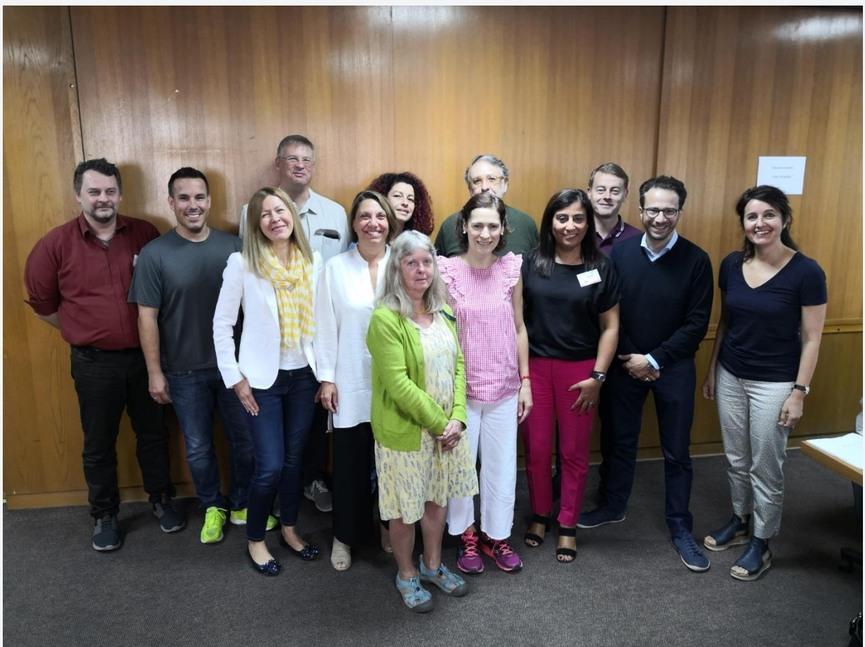
The presidium of ESREA in 2019

We would like to express our gratitude and acknowledgement to all three for their commitment and the work they have accomplished for ESREA so far and wish them all the best for the future! We are very confident that they will stay tuned with us and remain active members of the Society.